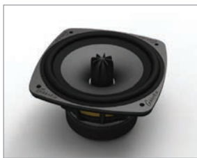
High-Definition Cast-Basket Bass/Midrange Drivers