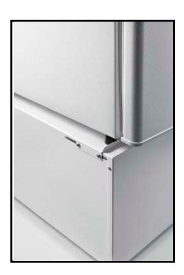
Front legs of refrigerator are positioned behind lip of pedestal