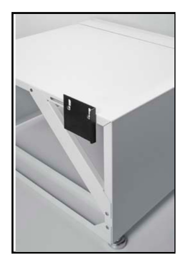
Rear of pedestal showing pre-mounted Bracket 2