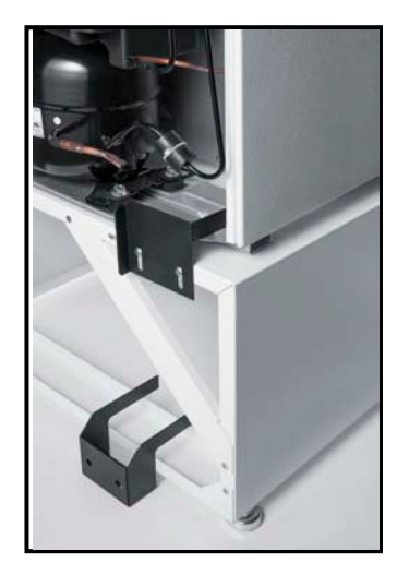
Refrigerator mounted on pedestal and positioned under Bracket 1