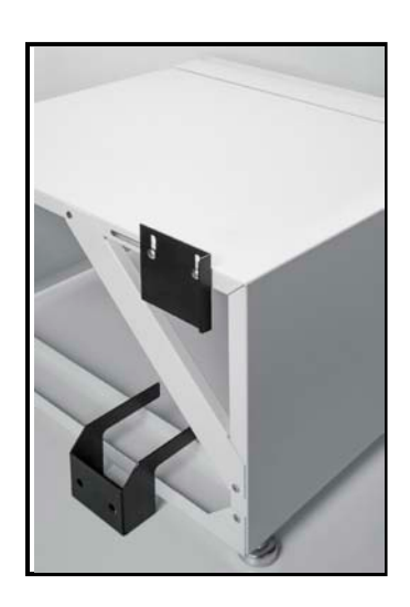
Bracket 1 mounted to the floor