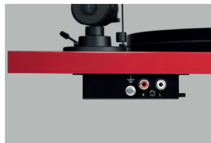
Switchable line or phono output