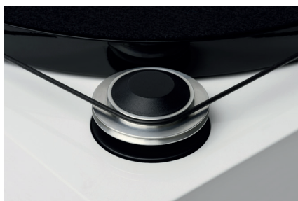
Diamond-cut aluminum drive pulley: precise power transmission