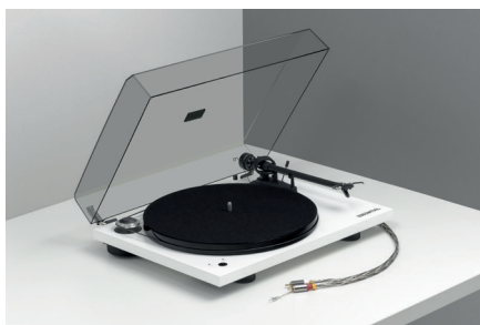
Dust cover, felt mat and high quality connection cable Connect-it E included