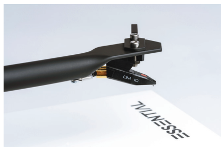
One piece 8.6" aluminum tonearm Cartridge: Ortofon OM10

standard version, such as the diamond-cut aluminum drive pulley, the resonance-optimized MDF main platter and MDF chassis. The refined, high-precision platter bearing has significantly lower tolerances than Essential II. Equipped with the high-quality pickup OM10 by the phonographic cartridge pioneer Ortofon, Essential III Phono delivers lively, balanced and highly involving sound that will delight every vinyl lover.