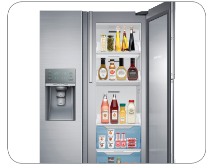
Food ShowCase Fridge Door