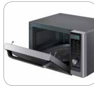
Drop Down Door