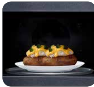
Convection Cooking with Slim Fry™