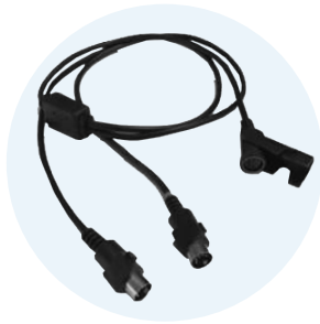
Pairing cable (1) *