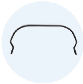
Mattress retainer bar (1)