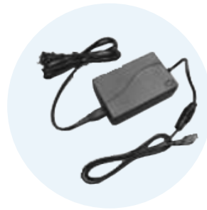
Power adapter (1)