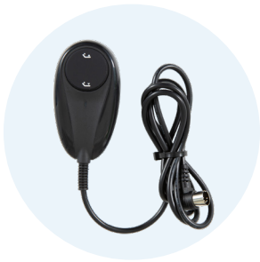
Wired remote control (1)

Check the adjustable bed carton and verify that all items on the parts list are included before throwing the packaging away.