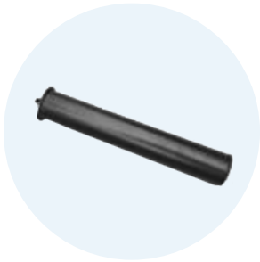
Post bed legs (6)