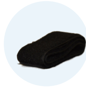
Bed leg strap (1) *

* Included in Twin XL bases. Used when connecting two bases together.