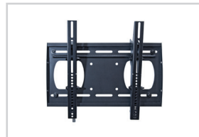
Use one mount for either portrait or landscape mode