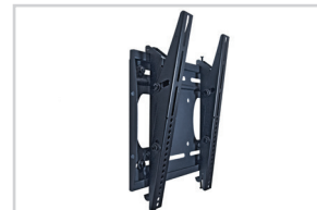
Displays sit less than 2 inches from their mounting surface