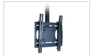
Mounts to walls, carts and stands, or suspended from the ceiling