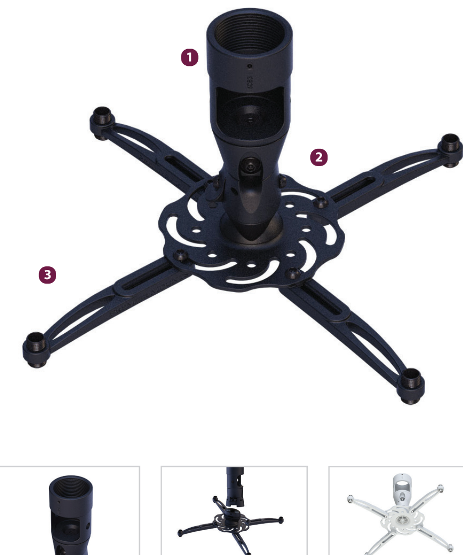
Integrated coupler attaches to the standard 1.5" NPT and features cable routing

The MAG-PRO universal projector mount fits most projectors that weight up to 10 lb. /4.5 kg. The integrated coupler attaches to a standard 1.5 in. NPT and includes a cable routing port, and the patented MagnaGuide™ feature reduces installation time by using powerful magnets to easily glide the integrated pipe coupler to the mount. A safety lever locks the two pieces together easily, and Radial Glide™ allows for up to 6° of smooth tilt adjustment and a simple lock-down screw secures the adjustments.