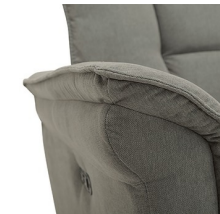
FLANGE WELT DETAIL