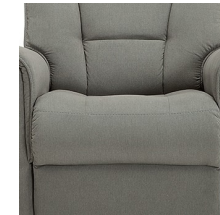
AVAILABLE IN 2 SEAT WIDTHS