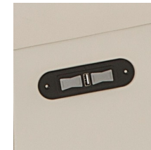
POWER BUTTON WITH USB CHARGER