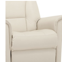
AVAILABLE IN 2 SEAT WIDTHS