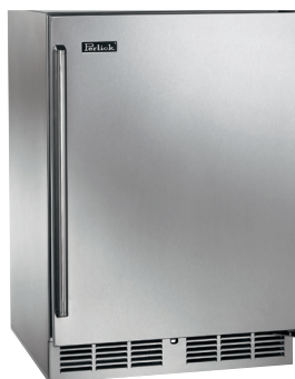
Solid Door Model