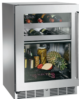
Glass Door Model