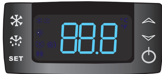
Figure 1. Digital Temperature Controller

Perlick Signature Series units come standard with state-of-the-art digital control. Please note there are two sets of instructions; one for 24" Signature Series Dual-Zone models, and another set for 15", 24" Single-Zone, and 48" Signature Series models.