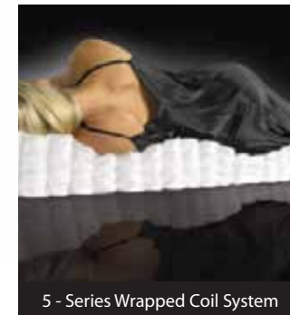
5 - Series Wrapped Coil System

Adjustable Base & BodyLogic™ Lifestyle friendly