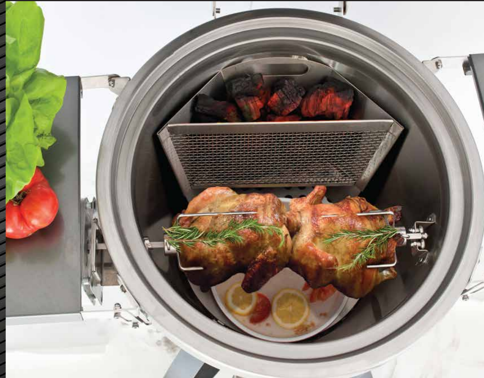
Caliber Indirect Blaze basket #CTP22-RB and the Caliber Rocking Rotisserie Kit #CTP22-RK shown above. The Caliber Rockin' Rotisserie Kit CTP22-RK includes the Rotisserie motor, rod, and forks as shown.