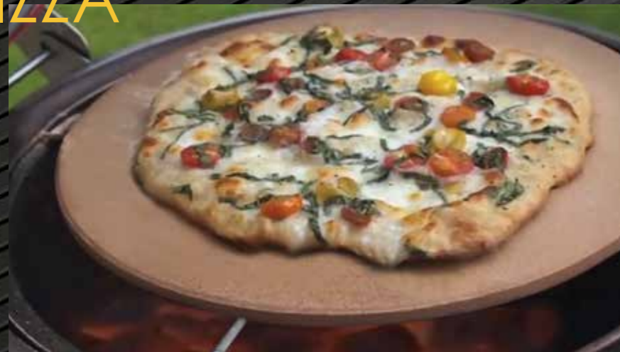
Perfect Pizza Kit #CTP22-PK shown above includes: Stainless Steel locating ring and 3/4" thick Commercial Quality Pizza Stone.