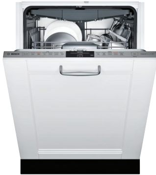
SHV68T53UC Panel Ready

The 3rd rack offers 30% more loading area. Perfect for ramekins, cooking utensils and extra-long silverware.