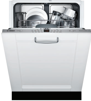
SHV53T53UC Panel Ready

Bosch dishwashers are so quiet, you may forget they're on. InfoLight® projects a red light onto the floor to let you know it's on.