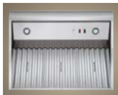
Large, easy-to-remove baffle filter and grease rail.