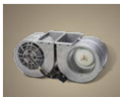
1200 CFM Internal Blower. Tested to ensure operation in corrosive environments.