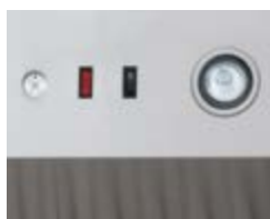
Bright halogen lighting and 4-speed control with illuminated ON/OFF indicator.