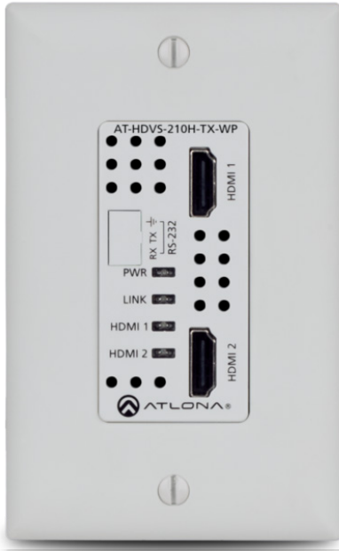
White trim shown with RS-232 cover.