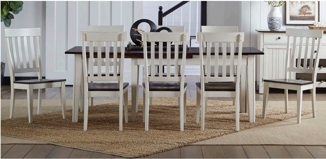
TOL-CH-2-35-K SLATBACK SIDE CHAIR 19"W x 40"H x 22.75"D