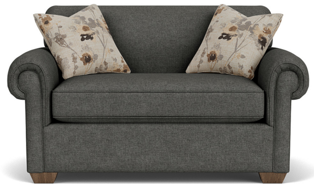
5988-41 in Fabric 818-02