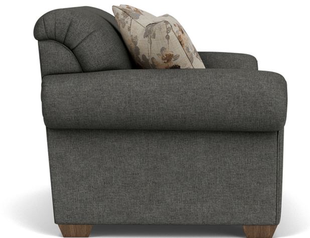
5988-41 in Fabric 818-02