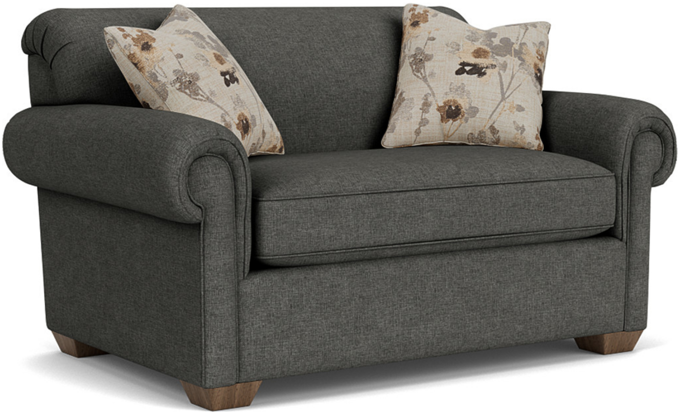
5988-41 in Fabric 818-02