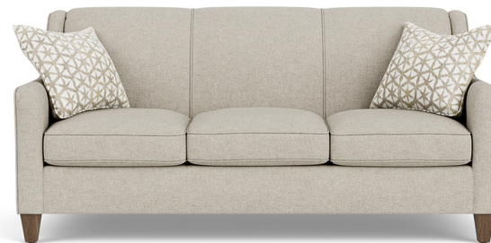
5118-44 in Fabric 818-01