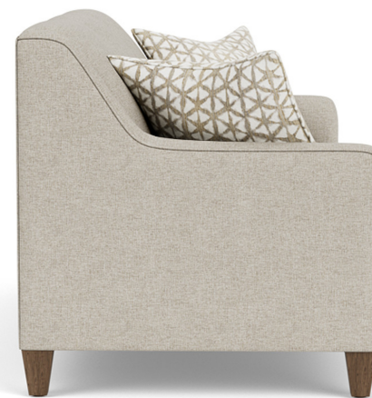
5118-44 in Fabric 818-01