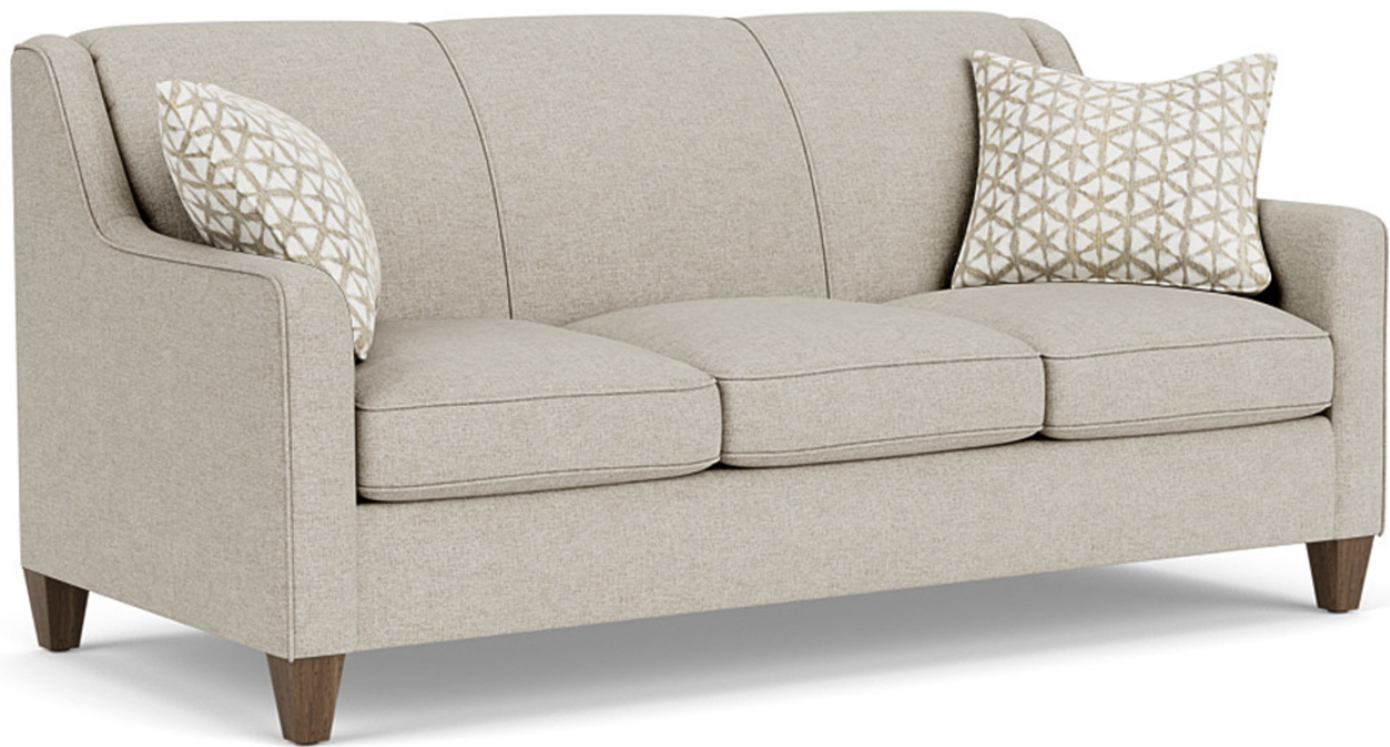
5118-44 in Fabric 818-01