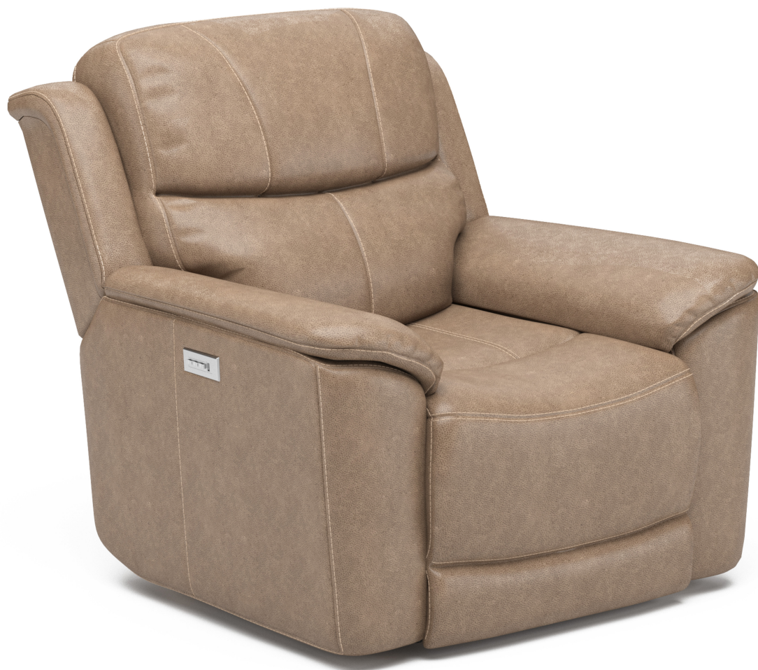
1183-50PH in Leather 637-80