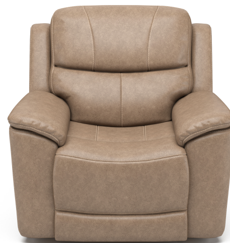
1183-50PH in Leather 637-80