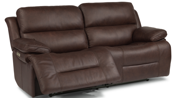
Power Reclining Sofa with Power Headrests 1849-62PH in 986-00