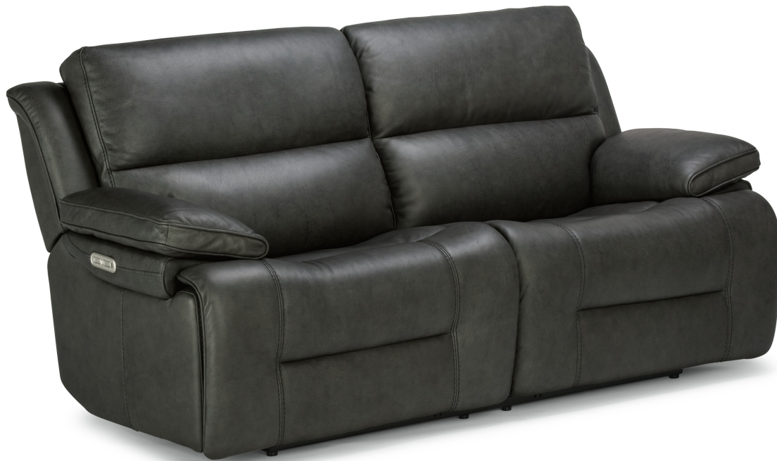
Power Reclining Sofa with Power Headrests 1849-62PH in 986-00