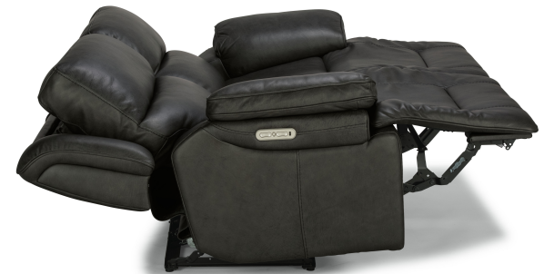
Power Reclining Sofa with Power Headrests 1849-62PH in 986-00