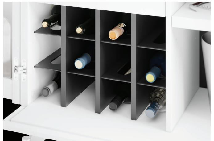
Storage for up to 12 wine bottles