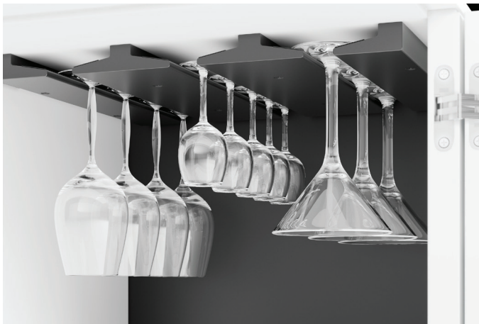
A wooden stemware rack protects glasses and minimizes vibration