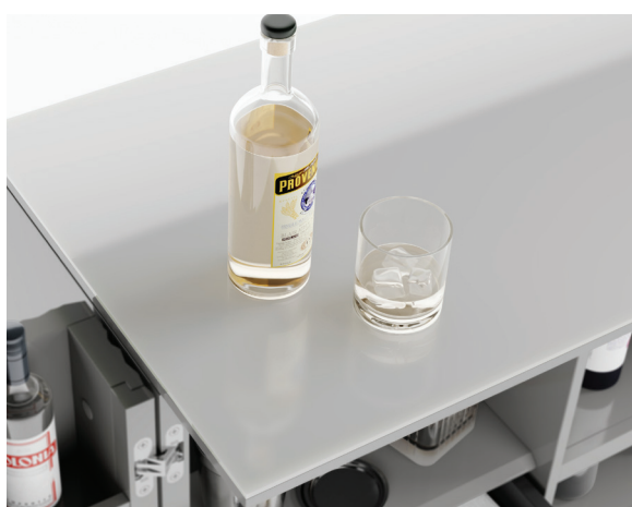
Satin-etched glass top allows for simple clean up