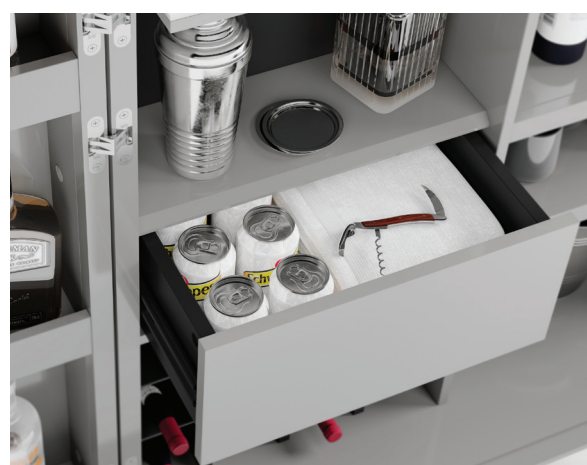
Storage drawer provides a home for utensils, mixers, and other supplies