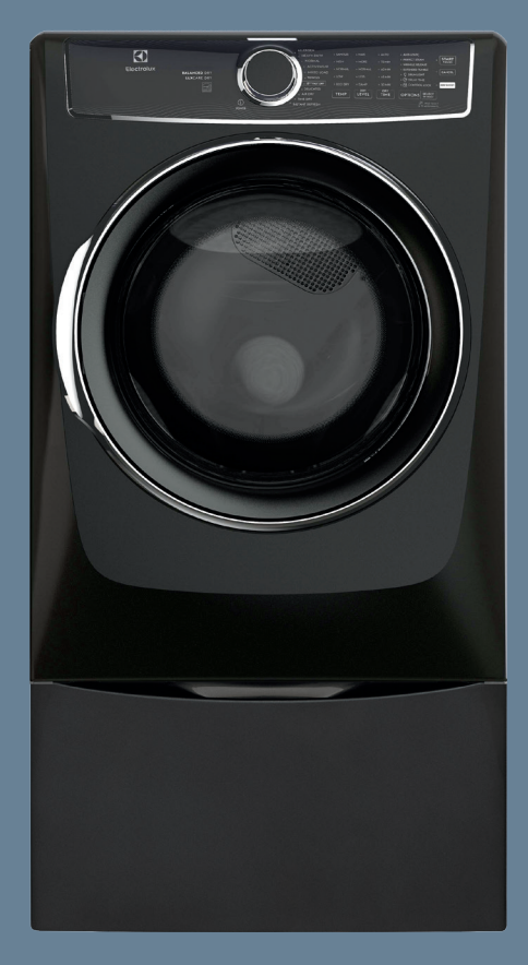
* Please note your model may look slightly different than pictured.