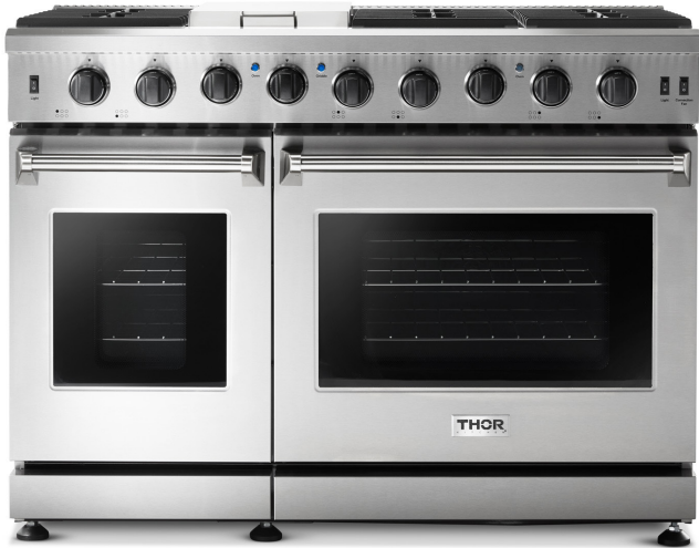
Product: 48 Inch Gas Range in Stainless Steel Model Number: LRG4807U / LRG4807ULP