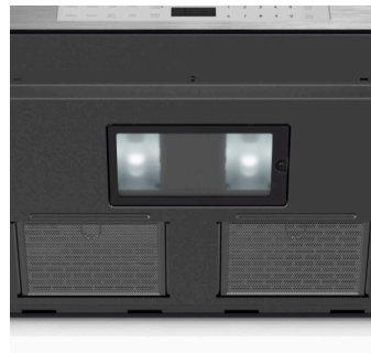
Easy-to-access, sliding grease filters allow for effortless, hassle-free replacement