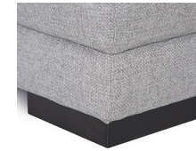
ESPRESSO WOOD LEG