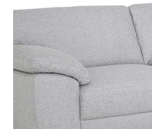
SEMI-ATTACHED BACK AND SEAT CUSHIONS