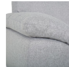
PILLOW TOP ARM