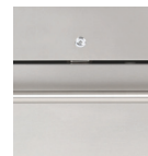
Stainless with Lock