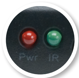
LED status lights