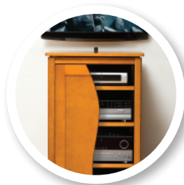
Reach components stored remotely or in cabinets