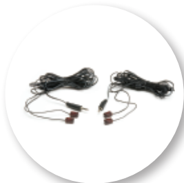
30KHz – 60KHz frequency range