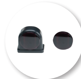
Includes tabletop and hole mounting options