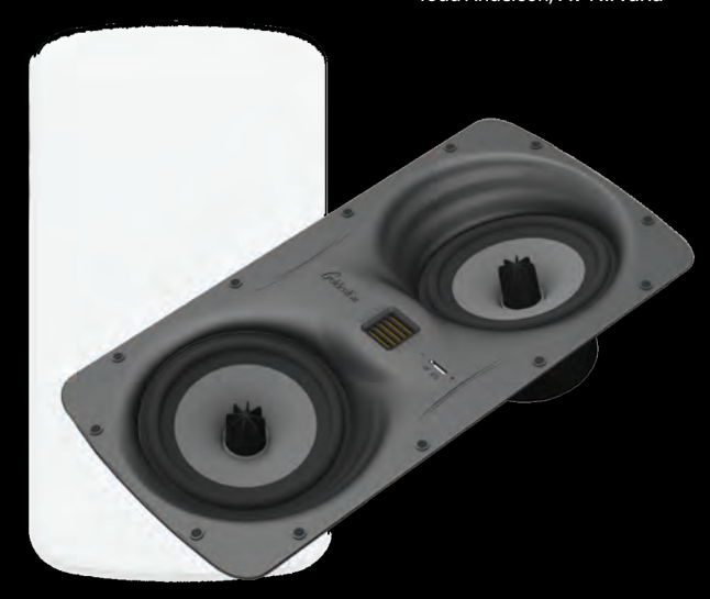
Invisa MPX MultiPolar