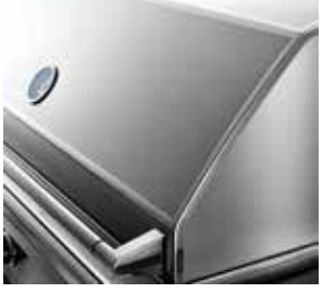
SEAMLESS WELDED CONSTRUCTION