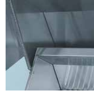
LYNX HOOD ASSIST

FOR MORE INFORMATION ON SEDONA BY LYNX™ SERIES PRODUCT FEATURES, PLEASE VISIT LYNXGRILLS.COM