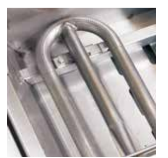
STAINLESS STEEL BURNERS