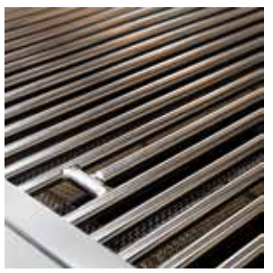
EXPANSIVE GRILLING SURFACE