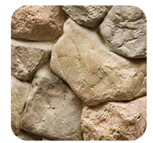
Shown in Fieldstone Finish

Wood slab top features a hand carved look and overextends the mantel for a commanding centerpiece