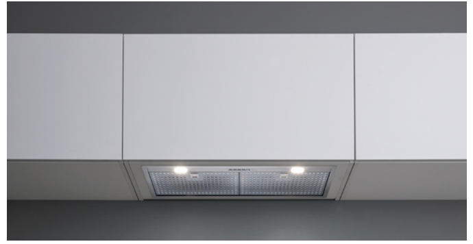
Photograph is for information purposes only May not correspond to the selected version