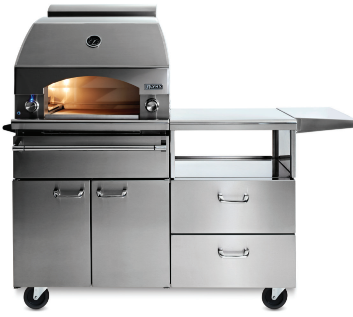
SHOWN ON 54" MOBILE KITCHEN CART