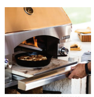
MOVEABLE COOKING SURFACE