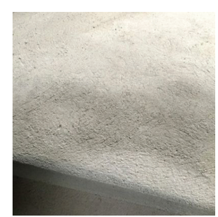
CONCRETE REFRACTORY DOME

The Napoli Outdoor Oven™ is always evolving. That philosophy is reflected in its features. We've refined these features to give you a cooking experience that's both simple and stunning.