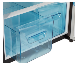
4 glass shelves 2 crisper drawers