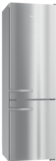
KFN 13923 DE - Right Hinged (In Field Convertible) Item 38139230USA