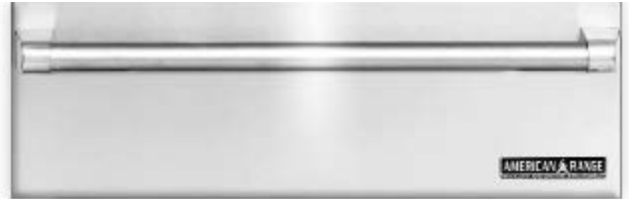
ARR-27WD VILLA 27" PROFESSIONAL STAINLESS STEEL WARMING DRAWER WITH CLASSIC HANDLE.