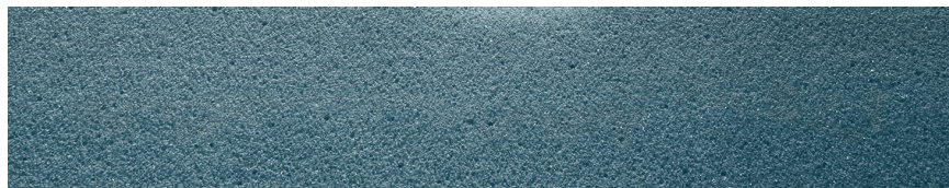
MOUSSE MÉMOIRE EN GEL AIRCOOL MD