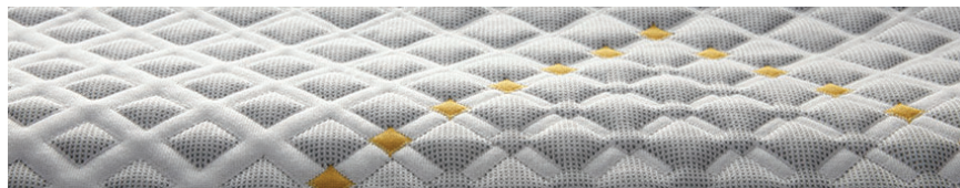
DESIGN DE TRICOT EXTENSIBLE CONTOURFIT MC