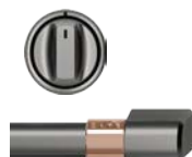
CXFCHHKPMBT Brushed Black 2 handles; 6 knobs