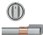
CXFCHHKPMSS Brushed Stainless 2 handles; 6 knobs