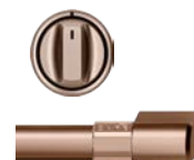
CXFCHHKPMCU Brushed Copper 2 handles; 6 knobs