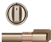
CXFCHHKPMBZ Brushed Bronze 2 handles; 6 knobs