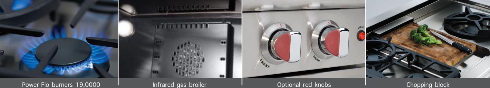
Power-Flo burners 19,0000 BTU-140 deg. simmer.