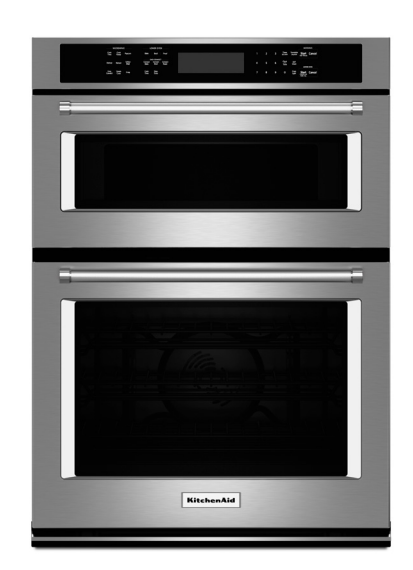
Stainless Steel KOCE500ESS