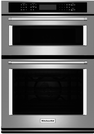
Stainless Steel KOCE500ESS