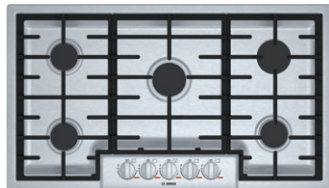
NGMP656UC Stainless Steel

The 36" Benchmark® Series gas cooktop features a dual-stacked burner that delivers both a low simmer and high heat flame.