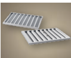
Hi-Flow™ baffle filters utilize a V-mesh & baffle design to increase airflow, decrease sound levels and provide excellent ventilation efficiency.