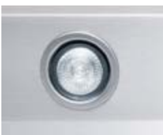
Halogen lamps brilliantly illuminate the cooktop.