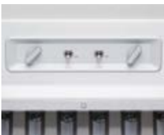
Variable speed control with last setting memory.