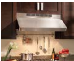
Optional non-ducted recirculation kit for use with internal blower models.