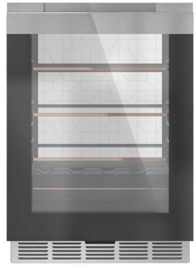
CCR06BM2PS5 Platinum Glass finish