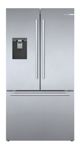
B36CD50SNS Stainless Steel Bar Handle