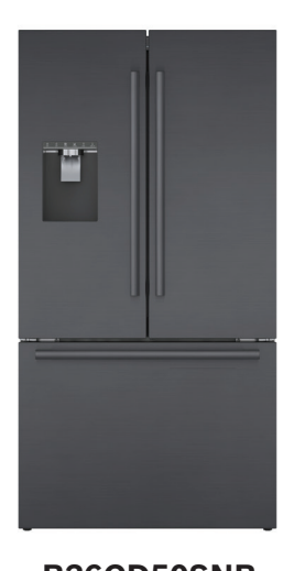
B36CD50SNB Black Stainless Steel Bar Handle