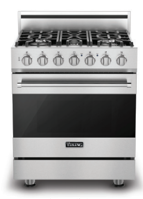
30" Wide Gas Self-Clean Range (Shown with optional 6" H. backguard)