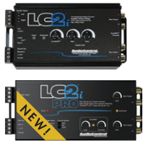
LC2i / LC2i Pro