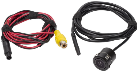
Camera and wiring